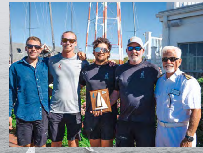
Results: yachtscoring.com/ emenu.cfm?elD=16371